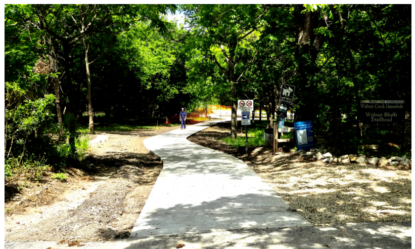
The New Path: Leading from the trailhead entrance to the "turnaround" circle behind Gary Brewer. Still can't go beyond the orange fence there at present.

At the time of this publication, our long-anticipated, ADA-compliant, concrete-paved park trail nears completion. It's even possible that, by the time you read this, all the concrete will be poured on "our side" of Lamar. The entry there will be the last section completed to provide the 12-ft wide, hard-surface thoroughfare through Walnut Bluffs Trailhead, following the trail initially established by Gary Brewer in the early 2000s. It will allow almost anybody wishing to visit our little paradise to do so under most weather conditions, whether by foot, bicycle, wheelchair or other conveyance not engine powered. Twelve feet is wide enough to allow safe passing of two bicycles (assuming both riders know and follow the rules of etiquette), demonstrating how this project is also part of Austin's mobility plan and not simply a park and recreation space. It won't be used for through-transit for a while, though, as it ends with the circle near our Oakbrook entrance, just visible back behind Gary in the picture above (look closely!).