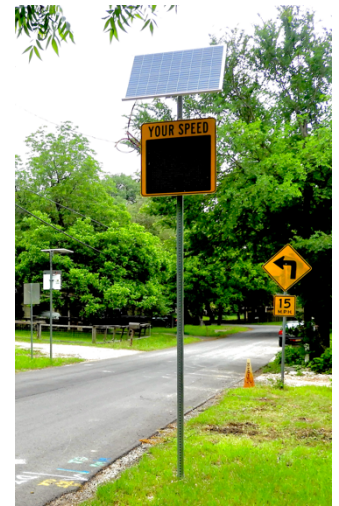
Speed monitors on Whitewing

You may not see your speed displayed in a particular time period, as the normal procedure with these is to collect "background" behavior for a period before turning the display on. Thus the effect of having your speed shown to you can be determined, and potentially the effect of changing the speed limit. Many factors go into deciding when a speed limit change is needed, including – in a residential area – how wide the streets are and whether there are sidewalks. From discussions with one of the engineers involved with the measurement projects, it is likely that a lower speed limit will be recommended for much or most of our neighborhood.