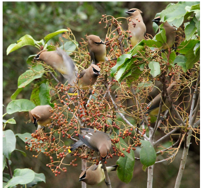
Cedar Waxwings Devouring Holly Berries Before "Big Freeze" Storm Uri in February 2021

The live oak, little walnut and native pecan trees are like an HEB for many species of birds. It's not the acorns or pecans they eat, but rather the myriad of insects they house throughout the year. Keeping your live oaks healthy is important. Oak wilt ( https://texasoakwilt.org ) is a devastating disease that can kill the trees so please be sure to only trim the oaks in the dead of summer or after the first hard freeze in winter.