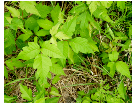
Watch out for Poison Ivy, especially very near the natural footpaths in our park.

The “Walnut Creek Trail” has been “in the works” for nearly 40 years, mostly under the Public Works