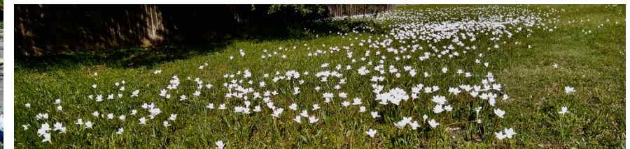
Finally: Rain after several dry months produces rainflowers on Hornsby (above) and Scurry.

We won! Austin prevailed in the law suit brought by big sign companies to abolish our law restricting new advertising billboards to "on-premise" only. The city has been enforcing this rule for years, provoking continuous law suits from big billboard companies based on their free-speech rights. The issue finally was decided in the U.S. Supreme Court in late April, with Austin – and all cities – affirmed the right to restrict outdoor advertising to on-premises only, meaning the sign must be on the property of the business advertised. Non-profits interested in beautification and safety experts worried about distraction caused by rapidly-changing digital signs supported Austin in the case. Existing billboards can remain but can't be changed to digital.