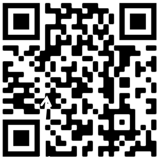
QR Code to pay dues or donate

PayPal is a popular way to become – or remain - a member, or to make a donation toward WCNA projects (shown on drop-down menus on the Donate site). You can use any credit card to make a payment via PayPal through the “join/donate” page on the WCNA website, https://wcnanews.com/membership/