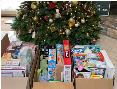
Some of the gifts for B.I.G. Love clients

Walnut Creek neighbors donated 50 toys for a B.I.G. Love holiday shopping event. Parents were thus able to shop for their children from a large collection of toys. I truly appreciate the support of all of the neighbors who participated!