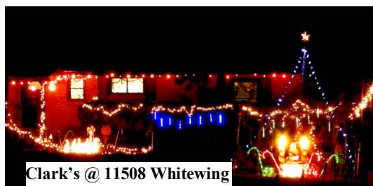
Clark’s @ 11508 Whitewing