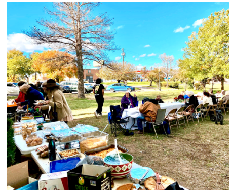
Neighbor's Table participants begin...!