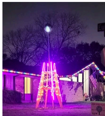
New Year’s Ball Waiting to be “Dropped”